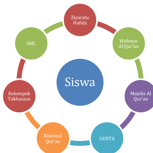
Figure 2 Model of instilling Qur'anic values in students.

The instillation of Qur'anic values is also integrated into all subjects. Teachers are required to incorporate the value of tawhid into every lesson (Ramadhani et al., 2020). Supervision is carried out systematically by the head of the tahfidz and tahsin department. Lesson plans are designed with both spiritual and worldly elements. This supervision model ensures the consistency of Qur'anic values in learning. Cross-subject integration strengthens the internalization of values.