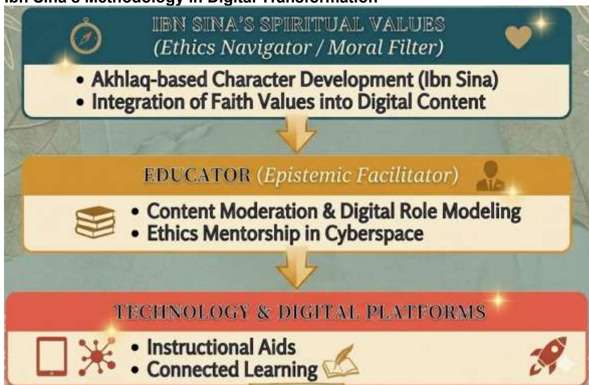
Figure 2. Integration Framework of Ibn Sina's Spiritual Values in Digital Learning

The Society 5.0 era demands an integration between artificial intelligence (AI) and human values. Recent literature proposes the Blended Spiritual-Connected Learning (BSCL) model as an adaptation of Ibn Sina's methodology in the digital age, where technology serves as an instructional tool (such as digital demonstration methods), Ibn Sina's spiritual values function as a moral navigation (filter) for students, and educators remain central figures as epistemic facilitators who guide the internalization of ethics amid an onslaught of massive data (Aulia & Yuliyanti, 2024; Shobirin et al., 2025). Technically, Ibn Sina's aspect of 'role modeling' is